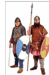
Skjold means "shield"