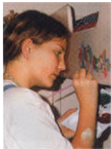
Learning rosemåling (Norwegian painting) at summer language camp

Each month we have a brief business meeting, our program for the day, and food, beverages, fellowship, and good conversation.